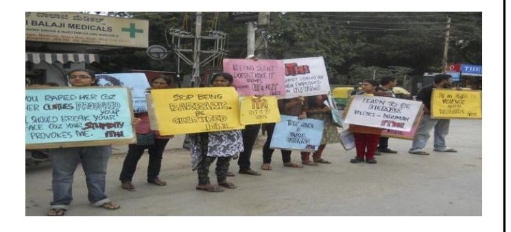
A feeling of respite comes from the fact that Courts have acknowledged the fact that the standards of morality have not