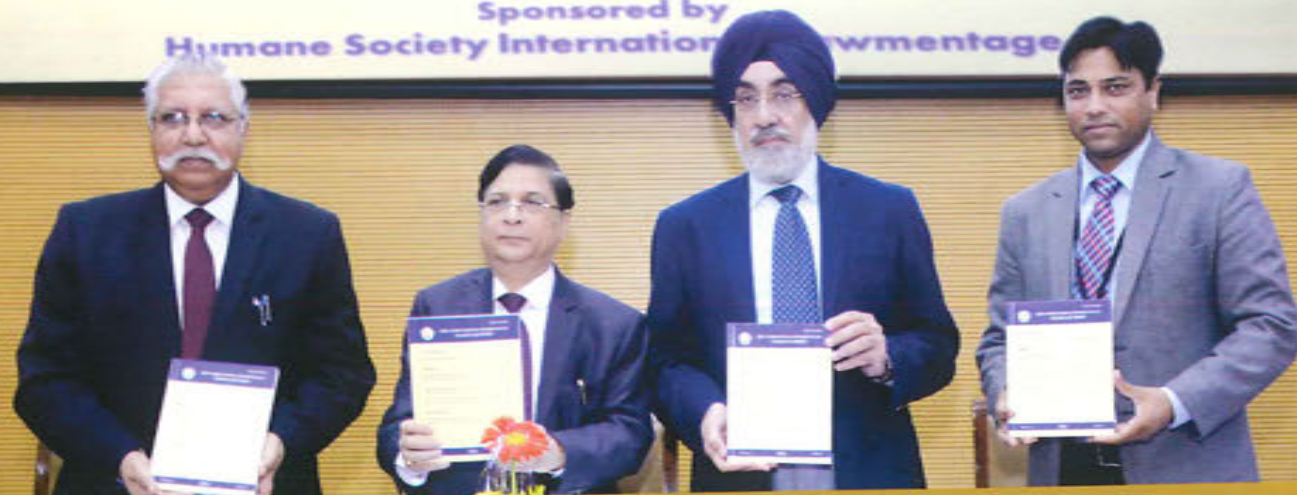
The Distinguished Guests Releasing RGNUL, Publication

Sponsored by Humane Society International