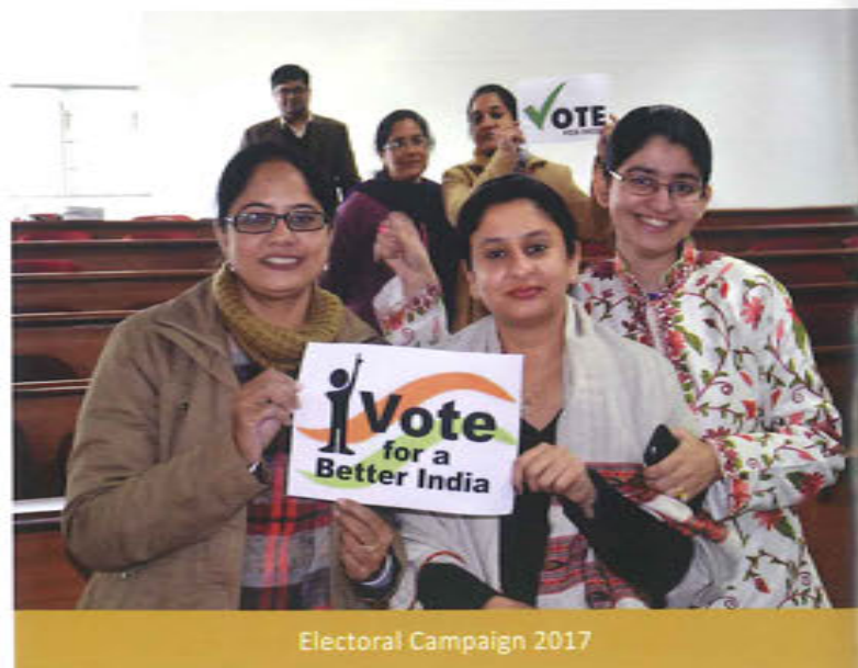
Electoral Campaign 2017

CBCS was also reviewed so that it may be adopted and incorporated from the next academic session. The examination system has been upgraded by the adoption of the Cumulative Grade Point Accreditation (CGPA) System of evaluation along with the method of assessment through marks. This has been done with a view to facilitate selection of students for internships and for final placements or for higher studies abroad. The University meets the requirement of Honours Course at the under graduate level in the specialised subjects by offering eight specialised papers in each specialization.