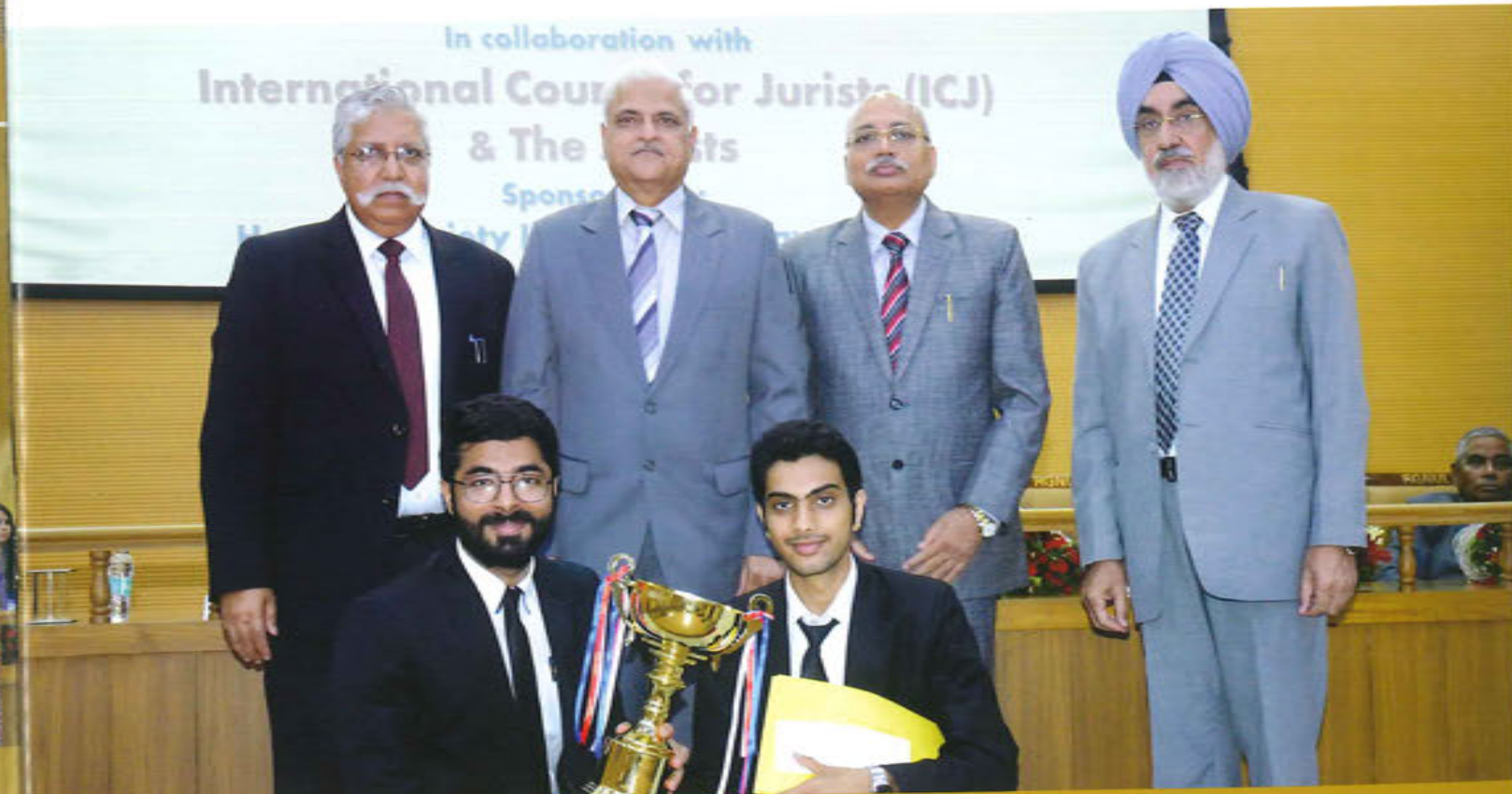
The Distinguished Guests with Winners

In collaboration with International Council for Jurists (ICJ) & The Jurists Sponsored by Humane Society International