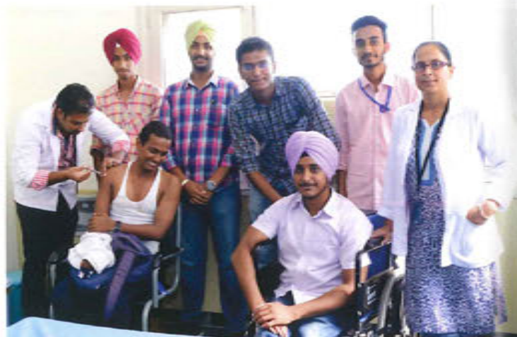
Students and Staff at University Health Centre (UHC), RGNUL