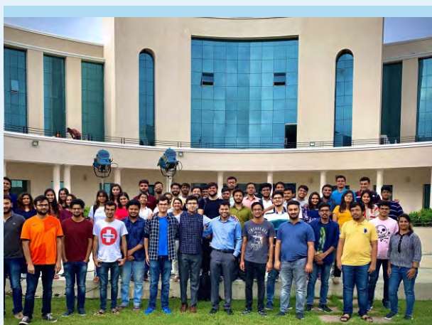
Delegate on the CADR - Triumvir Credit Course on Investment Arbitration