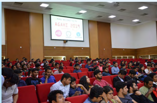
Participants at the Agahi National Parliamentary Debate Competition 2019