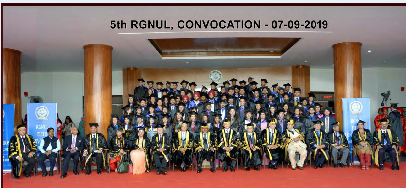
B.A.LL.B. (Hons.) FYIC Batch - 2014-2019 along with Hon'ble Members of the Statutory Bodies of RGNUL, Punjab