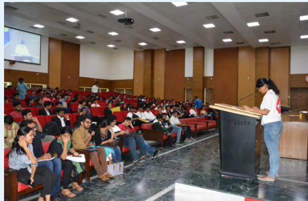
Participants at the Mock Mediation Workshop

Mock Mediation Workshop 3rd October 2019- Giving a first-hand experience to the students regarding mediation was a great event of success. With the rising trends of mediation, workshop gave a practical outlook to the students about both the actual mediation and relevant mediation competitions.