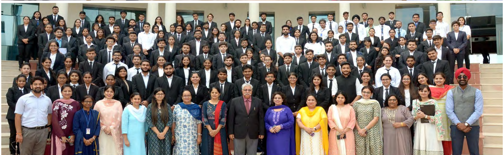
RGNUL Moot Court Competition 2019