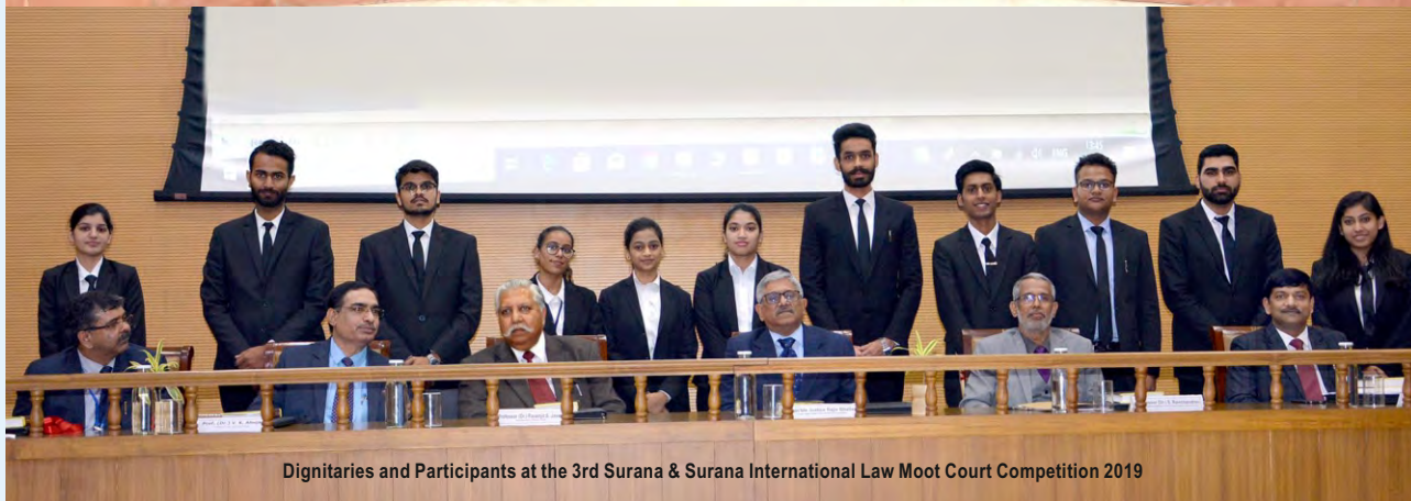
Dignitaries and Participants at the 3rd Surana & Surana International Law Moot Court Competition 2019