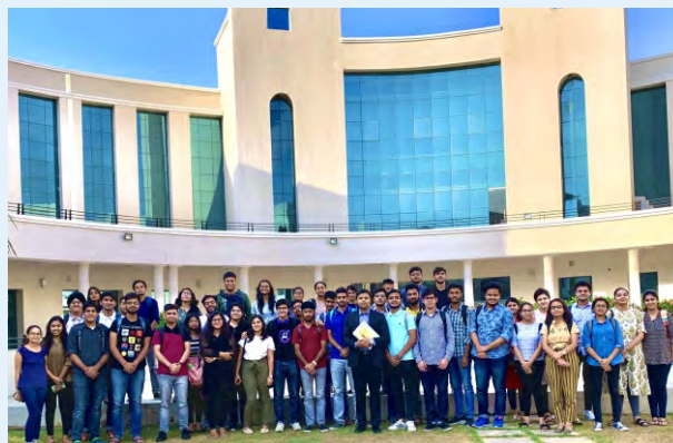
Participants at the Sam-Pact Workshop on Arbitration

Sam-pact Workshop On Arbitration 19-20 October 2019 organised in collaboration with