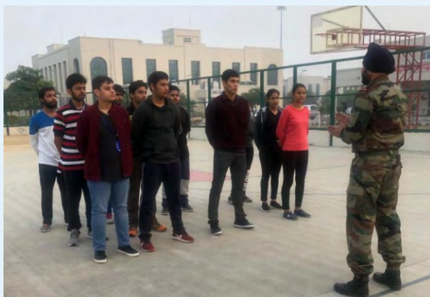
NCC Cadets Induction Programme