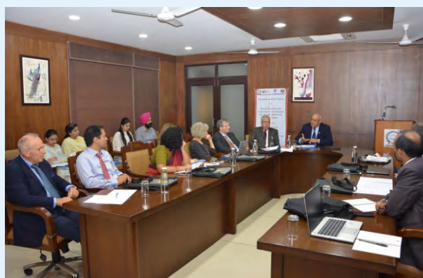
Participants at the Post Graduate Winter School on Legal Pluralism and Governance in the Global South: Challenges and Opportunities

Post-Graduate Winter School on 'Legal Pluralism and Governances in the Global south: Challenges and Opportunities' was organized in collaboration with National Law University, New Delhi and in association with University of Campania 'Luigi Vanvitell' Naples, Italy and HPNLU, Shimla from 30 October to 4th