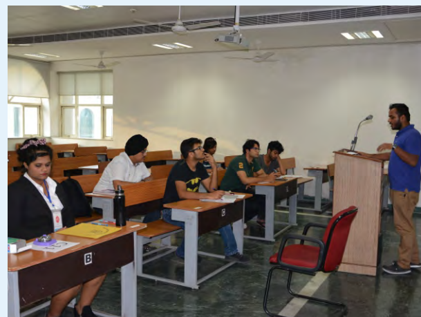
Participants at the Agahi National Parliamentary Debate Competition 2019

Rajiv Gandhi National University of Law, Punjab organized AGAHI'19 National Parliamentary Debate Competition from 4-6 October 2019. 38 teams from across the country participated including teams from Chanakya