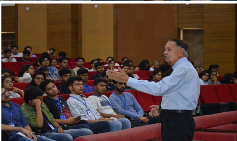
Lecture Series Orientation Week 2019