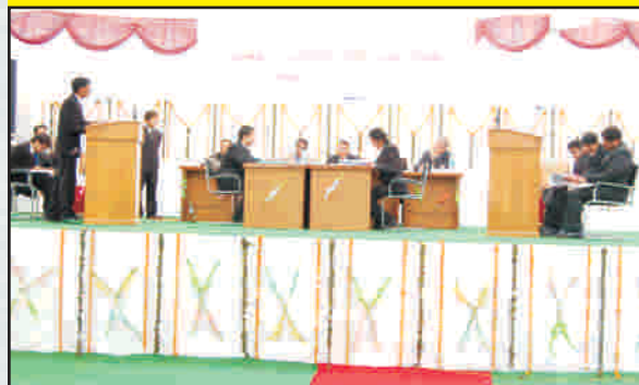
FINAL ROUNDS OF THE XXIV THE BAR COUNCIL OF INDIA MOOT COURT COMPETITION 2008