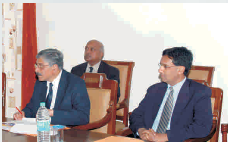
HON'BLE MR. JUSTICE RAJIVE BHALLA AND PROFESSOR G. MOHAN GOPAL

of the new campus to take stock of the on the spot progress of the construction work, where the boundary wall work is almost near completion and the earthwork on the roads was going on. The Chancellor was appraised about the phases of construction and also of the location of various blocks of the building at the site.