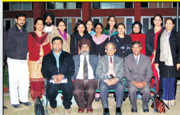
RGNUL FACULTY AND OTHER PARTICIPANTS AT THE ONE DAY WORKSHOP