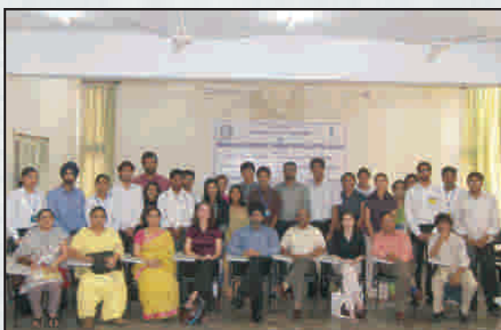
THE VICE-CHANCELLOR, SENIOR LAW FACULTY AND THE CONVENOR OF THE TWO DAY INTERNATIONAL WORKSHOP ON HUMAN RIGHTS ADVOCACY: THINKING GLOBALLY ACTING LOCALLY, ALONGWITH THE PARTICIPANTS AND VOLUNTEERS