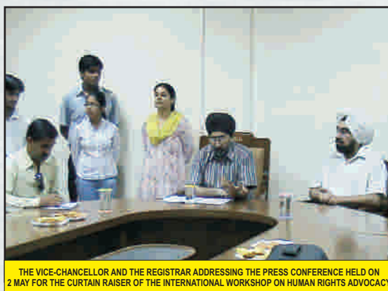
THE VICE-CHANCELLOR AND THE REGISTRAR ADDRESSING THE PRESS CONFERENCE HELD ON 2 MAY FOR THE CURTAIN RAISER OF THE INTERNATIONAL WORKSHOP ON HUMAN RIGHTS ADVOCACY