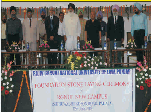
OUR DISTINGUISHED GUESTS AT THE AUDITORIUM