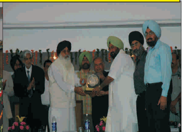
SARPANCH OF VILLAGE SIDHUWAL BEING HONoured BY SARDAR PARKASH SINGH BADAL HON'BLE CM PUNJAB