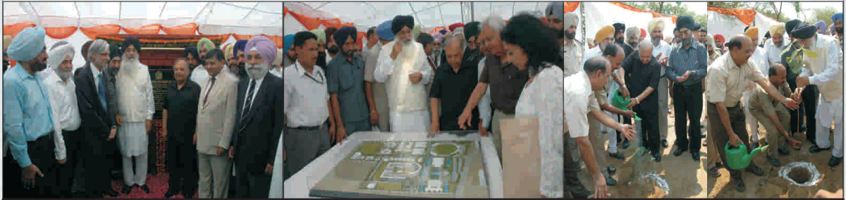
OUR DISTINGUISHED GUESTS AT THE SITE