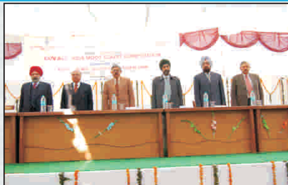
OUR DISTINGUISHED GUESTS AT THE XXIV BAR COUNCIL OF INDIA MOOT COURT COMPETITION 2008