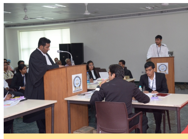
Moot Court Participants

The Hon'ble judges also released another RGNUL Publication the World in Transition: Challenges for Women Empowerment a compilation of selected papers.