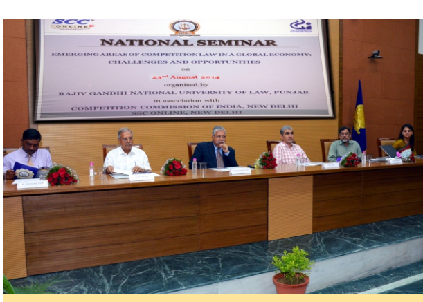
Dignitaries at the Inauguration of the National Seminar

>> One Day National Seminar on "Emerging Areas of Competition Law in a Global Economy: Challenges and Opportunities"