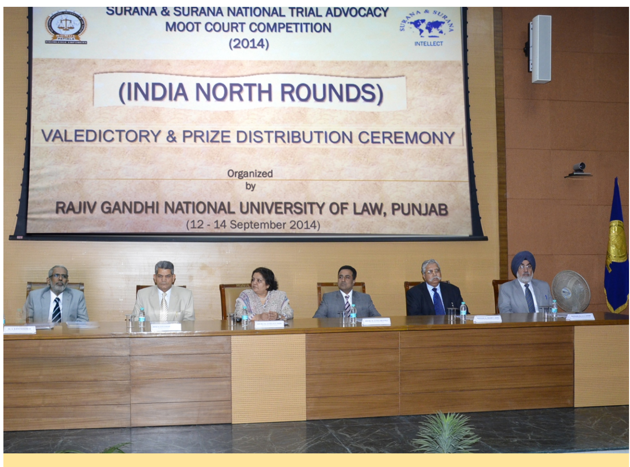
Dignitaries at the Valedictory & Prize Distribution Ceremony of the Surana & Surana Trial Advocacy Moort Court Competition (India North Rounds)