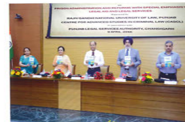
The Distinguished Guests Releasing RGNUL Publications.