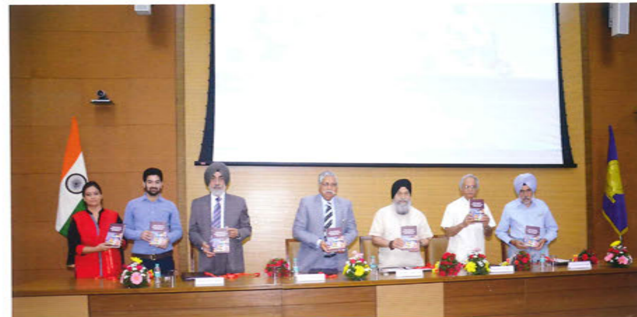
The Distinguished Guests Releasing RGNUL, Publication.