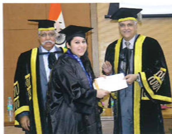
Hon'ble Mr. Justice Anil R. Dave, Judge Supreme Court of India and Visitor RGNUL conferring Degrees

High Court Judges, Judges from District Courts, Vice Chancellors from other universities of India, Administrators from Centre as well as State offices, renowned lawyers and other dignitaries graced the occasion with their presence.