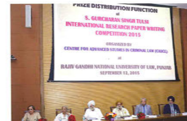
The Distinguished Guests.