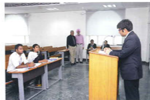
RGNUL students at Freshers' Intra Moot.

The Freshers' Intra Moot Court Competition was organized for the 1 st year students on September 8,