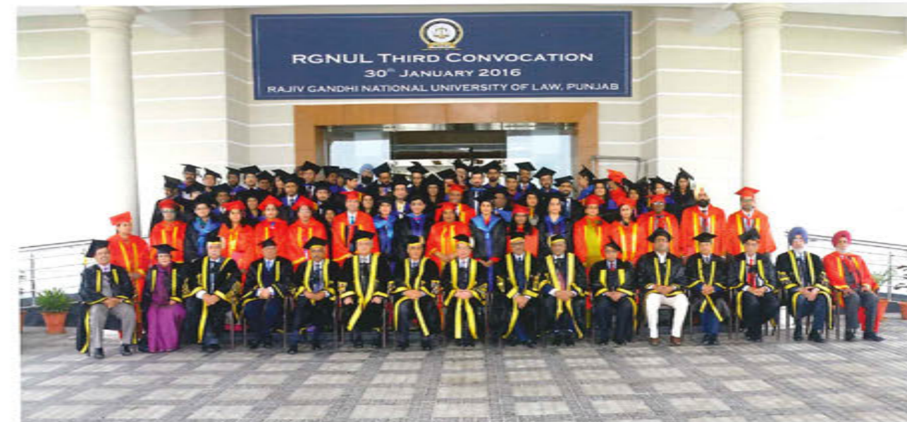
Distinguished Guests with Students and Faculty Members at the 3 rd RGNUL Convocation.