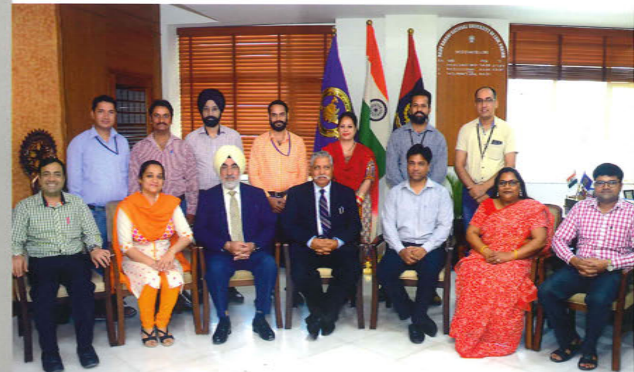
CLAT Committee 2016

CLAT-2016 has been appreciated for complete transparency and prompt grievance redressal of the Candidates. RGNUL stands tall and satisfied after successful conduct of CLAT-2016.