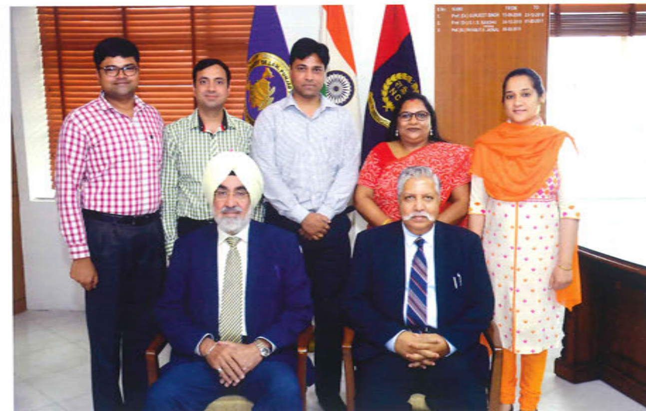
CLAT Committee 2016