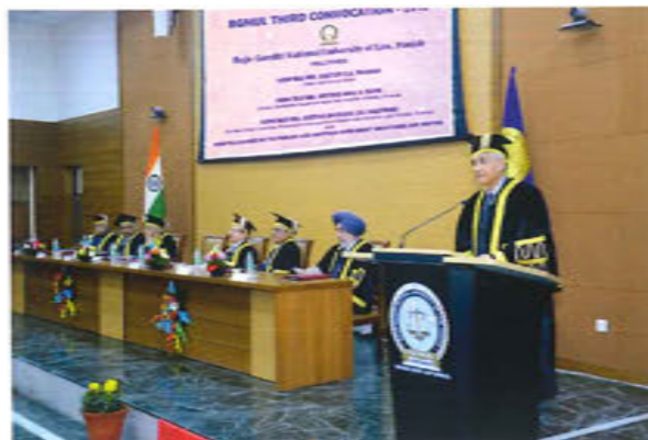
Hon'ble Mr. Justice T.S. Thakur, Chief Justice of India delivering Convocation Address.

'Self Respect' should not be compromised at any point of life , said the Chief Guest, Hon'ble Mr. Justice T.S. Thakur, Chief Justice of India. He said that it gives satisfaction if the lawyers understand that they are very important characters in the drama called life, for which they need to uphold 'ethics' to perform their job in a desirable manner. The law students having no background from legal field can still touch skies of success if they adopt the 'principle of perfection' which Judiciary and Judges duly respect. The most touching moment of the event was when the gathering witnessed eyes of