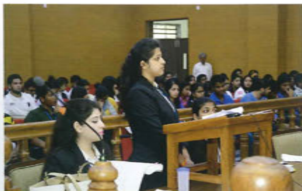
RGNUL Students during Intra Moot Competition.

This year the RGNUL Moot Court Committee organized the Intra Moot Court Competition for students from 2 nd - 5 th year on the 8 th and 9 th of August, 2015. Students represent the University in National and International Moots based on their