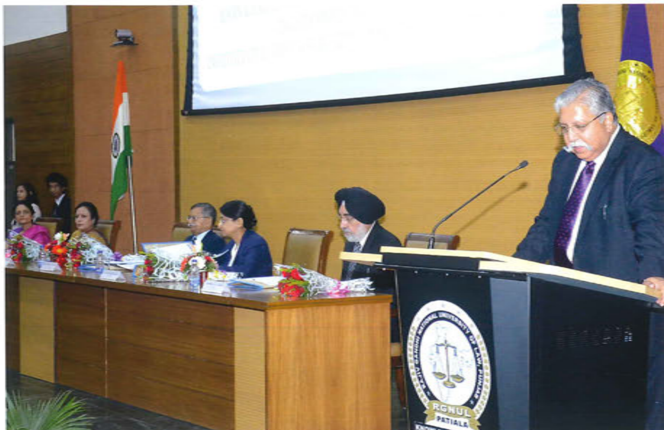
Distinguished Guests at the Inauguration of the Seminar