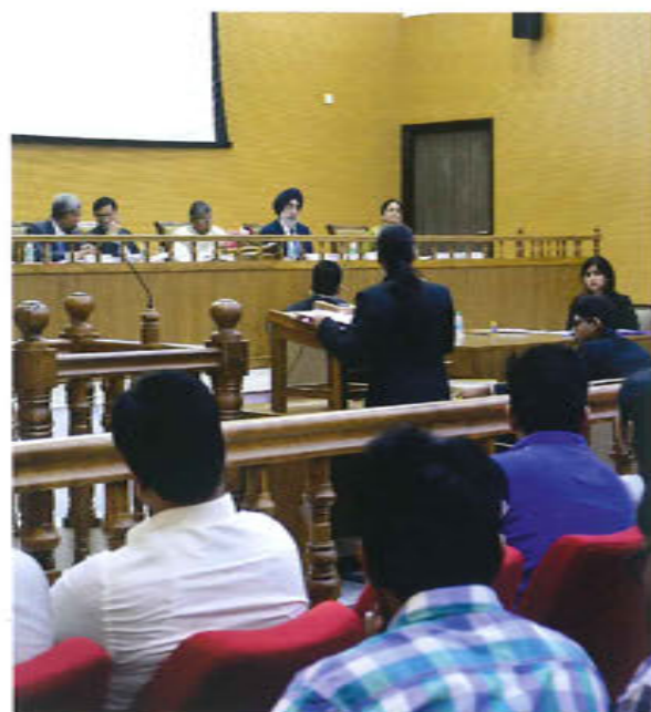
The Distinguished Guests at National Moot Court Competition.

This year Rajiv Gandhi National University of Law, Punjab hosted its fifth National Moot Court Competition from 25-27 March, 2016. The event witnessed overwhelming participation with 66 teams from across the country. The moot problem