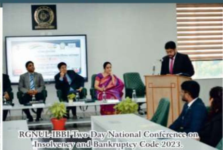
RGNUL-IBBI Two-Day National Conference on Insolvency and Bankruptcy Code 2023.