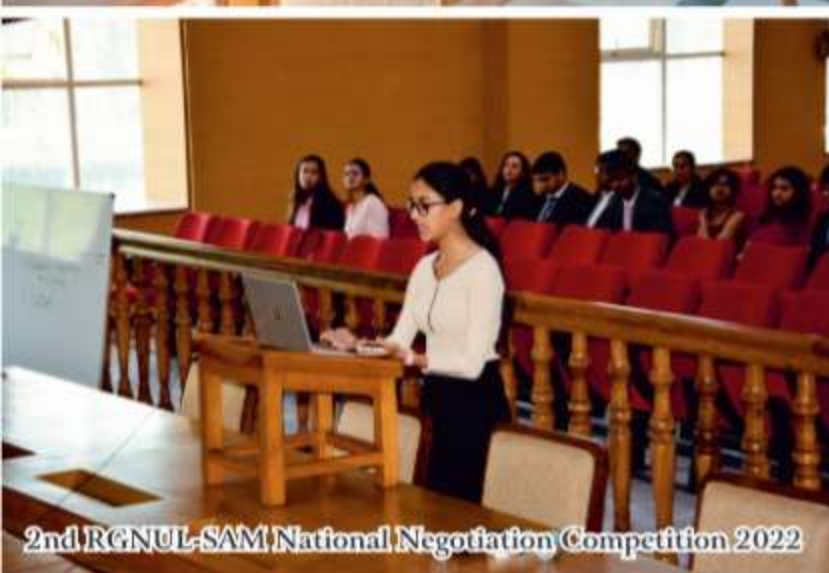
2nd RGNUL-SAM National Negotiation Competition 2022