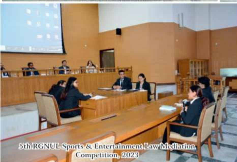
5th RGNUL Sports & Entertainment Law Mediation Competition, 2023