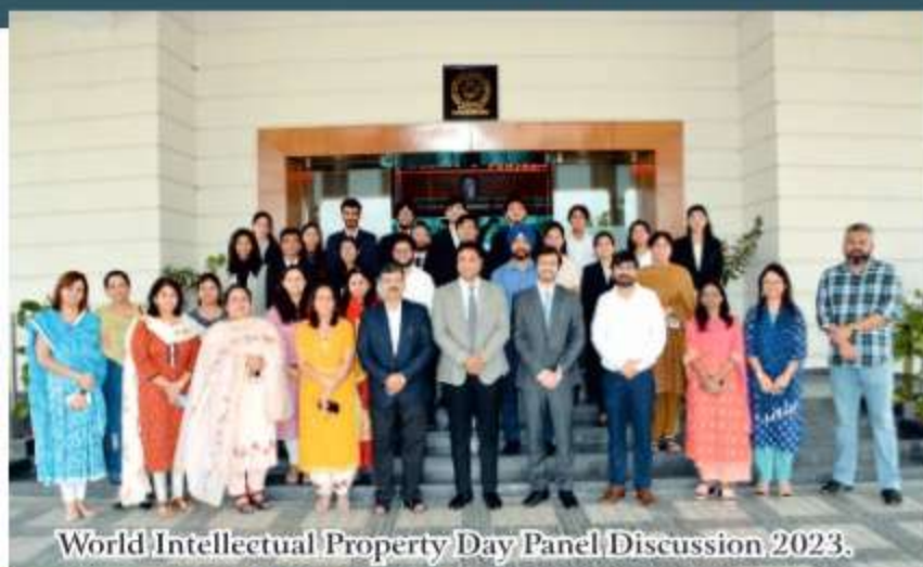
World Intellectual Property Day Panel Discussion 2023.