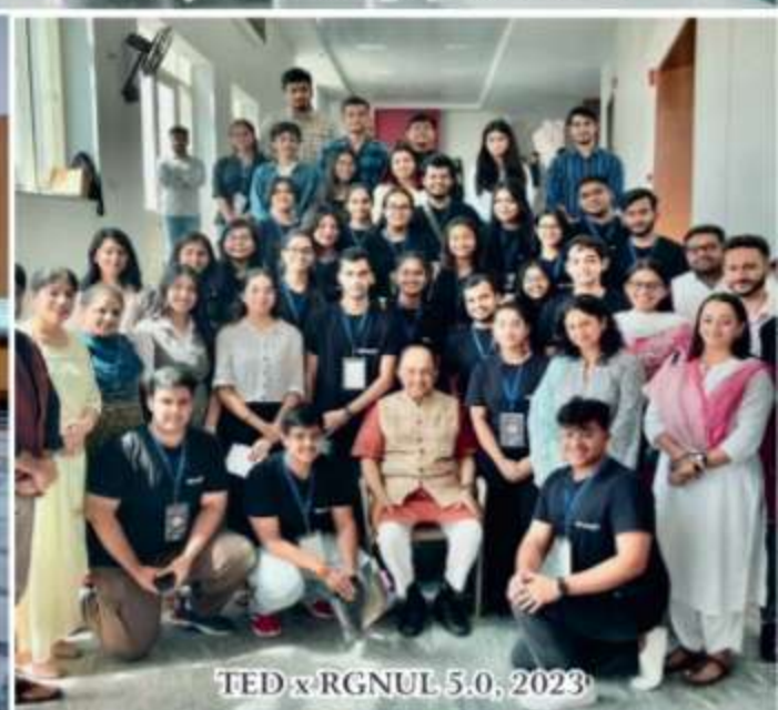
TED x RGNUL 5.0, 2023