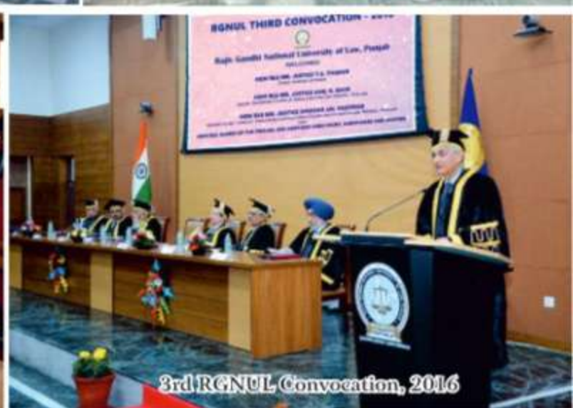
3rd RGNUL Convocation, 2016