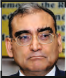
Justice Markendey Katju Chairman Press Council of India and Former Judge of Supreme Court of India

RGNUL Executive Council has appointed following Legal Luminaries as Visiting Faculty: